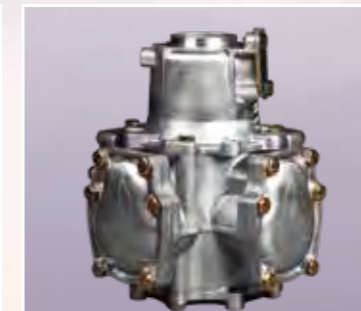
■ 4-Piston flow meter