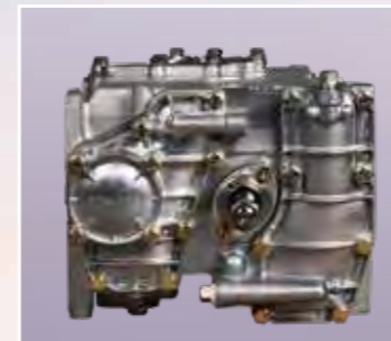
■ Gear Pump Type